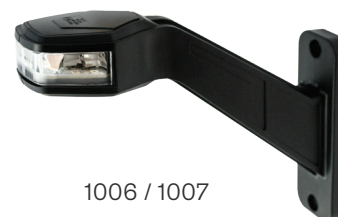
1006 / 1007