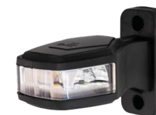
1008 / 1009